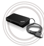
ThinkPad® OneLink Pro Dock

A special docking solution for ThinkPad®