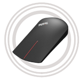
ThinkPad® X1 Wireless Touch Mouse

Wirelessly connect and expand the function of your device