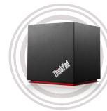
ThinkPad® WiGig Dock

Superior sound quality with a comfortable fit