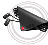
ThinkPad® X1 In Ear Headphones

A special docking solution for ThinkPad®